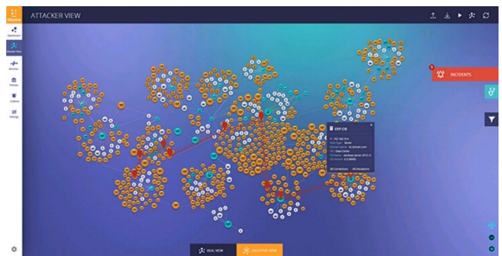
Attacker View Displaying Deceptions while Tracking an Attack

The illusive Attacker View allows enterprises to visualize and monitor attacker movements as they happen. In real-time, you can track attack-progress inside your network and extract forensics.