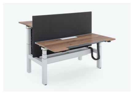
Combo benches allow the choice of extended-height, basic-height or fixed-height lifting columns per workstation.

Optional antimicrobial treatment available