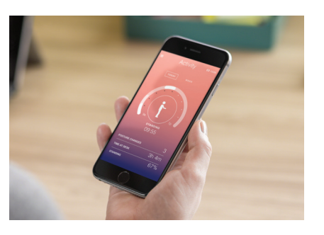
Compatible with both iOS and Android devices, the free Rise mobile app allows you to connect to workstations via Bluetooth in order to track sitting and standing activity. Available with the Active Touch controller