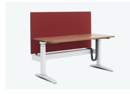
Single-sided benches are available to work in aisleways and around building columns.