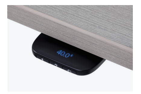
Active Touch controller