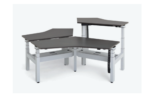
120 degree benches are available in triple, dual or single sided applications.