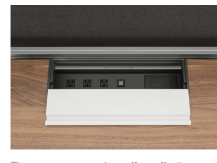
The power access door offers effortless access to three power outlets and two USB ports that provide two amps of power per port.