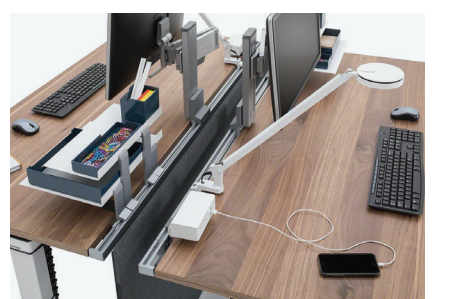
The integrated rail supports ergonomic tools such as lighting, monitor arms, screens and worktools.