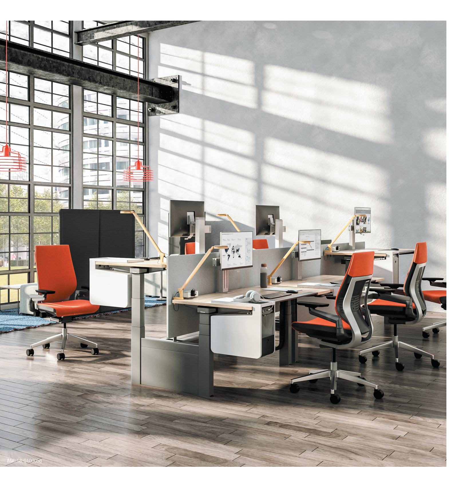
Ology height-adjustable bench