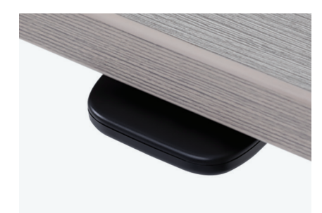
Simple Touch controller Optional antimicrobial treatment available

Ology's Simple Touch controller allows users to effortlessly move the desk up or down without taking their eyes off their work, while Active Touch reminds workers to change posture with Active Motion, subtle desk movements that remind users to maintain posture. Users create a profile with preset desk heights and preferred intervals of sitting and standing, and the Bluetooth-enabled controller seamlessly pairs with the Rise mobile app so users can take their presets with them and track their level of activity over time.