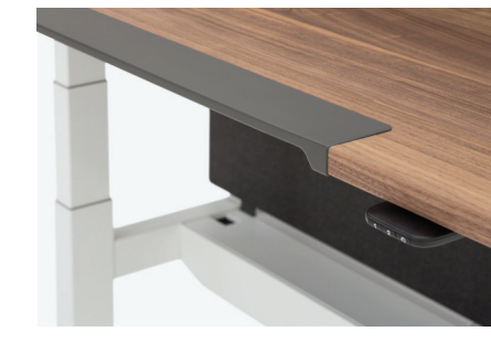
The soft edge embedded in the worksurface provides support for wrists and forearms to reduce stress on the neck and shoulders.

Optional antimicrobial treatment available