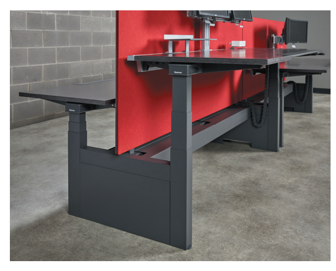
Centered screens are available for Ology benches and easily connect to the cable tray. Screens meet two overall heights, 42" and 48". Infills can be positioned at the end of a run or in line to conceal power and data infeed.