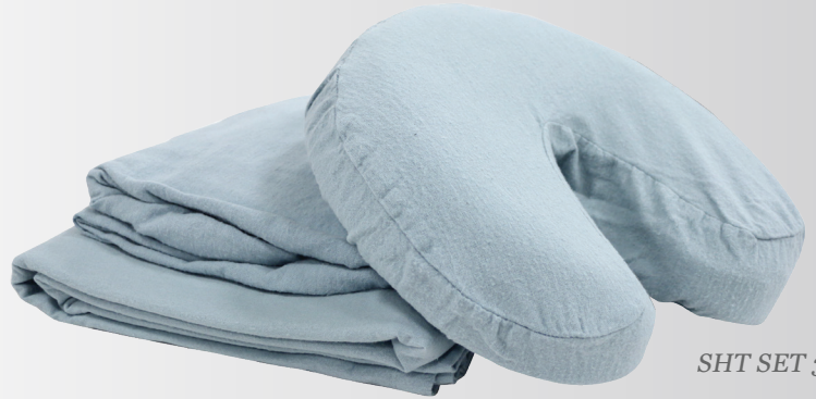
SHT SET 3pc

The Deluxe Double Brushed Cotton Flannel 3 Piece Sheet Set includes a flat sheet, fitted sheet, and face rest cover. Flannel massage sheets are lightweight and perfect for your table year round, providing a perfect balance between comfy and cozy. These high quality flannel sheets are double brushed for extra softness and made with 100% cotton, making it easier to get lotion, creams, and oil stains out. Flannel sheets will take the chill off and make it easier to provide a deep, relaxing experience for your clients.