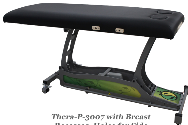
Thera-P-3007 with Breast Recesses, Holes for Side Arm Extensions (Foot End), Custom Base Color, and Custom Base Graphics