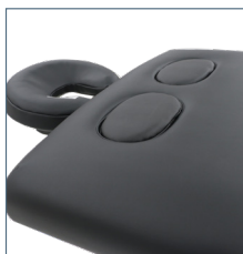
BR - Breast Recesses Option - Breast/Scapula Recesses include dual cutouts with central sternum/spine support (includes custom plugs)