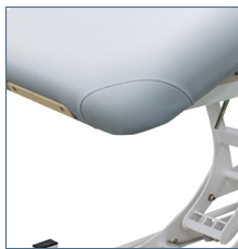
RC - Rounded Corners