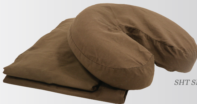
SHT SET P/C 3pc

The Premium Blend Poly/Cotton 3 Piece Sheet Set includes a flat sheet, fitted sheet, and face rest cover. These sheets are durable, affordable, and provide a wrinkle free, lightweight comfort that is normally only found with more expensive sheets. With an oversized flat sheet you can ensure your clients will be covered 100% of the time, allowing them to remain relaxed through position changes. The poly/cotton sheets are made specifically for massage tables and will give you the fit you desire.