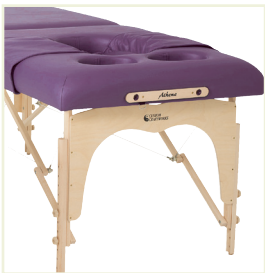
PG - Prenatal Option - Breast Recesses and belly cutout with adjustable sling to provide comfort and support to expectant mothers of any size (includes custom plugs)