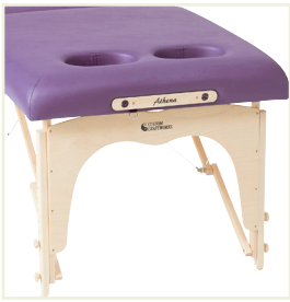
BR - Breast Recesses Option - Breast/Scaupula Recesses include dual cutouts with central sternum/spine support (includes custom plugs)