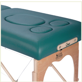
PG - Prenatal Option - Breast Recesses and belly cutout with adjustable sling to provide comfort and support to expectant mothers of any size (includes custom plugs)