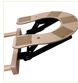
UP DPOS-B - Upgrade from Dual Action Face Rest Base to Deluxe Adjustable. Full range of adjustment is 4-6".