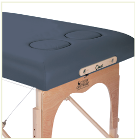
BR - Breast Recesses Option - Breast/Scaupula Recesses include dual cutouts with central sternum/spine support (includes custom plugs)