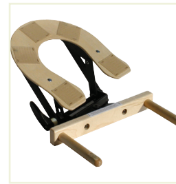
UP PPOS-B - Upgrade from Dual Action Face Rest Base to Pivot Posi-tilt. Full range of adjustment is 4-6" and pivots 30° in either direction.