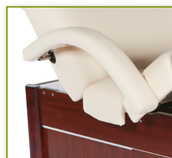
Folding Front Arm Shelf