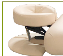
Folding Front Arm Shelf