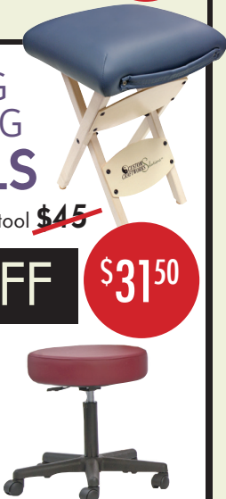
Premium Rolling Stool