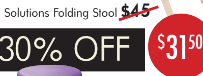
Solutions Folding Stool