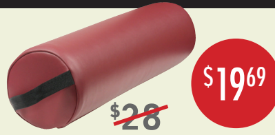
Solutions Round Ankle Bolster 6.3" x 24.8"