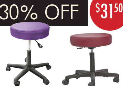
Solutions Rolling Stool