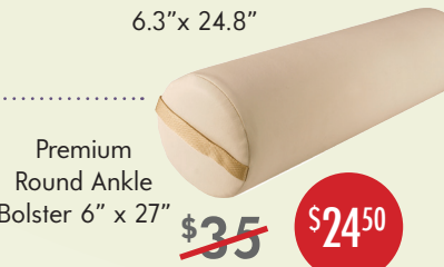
Premium Round Ankle Bolster 6" x 27"