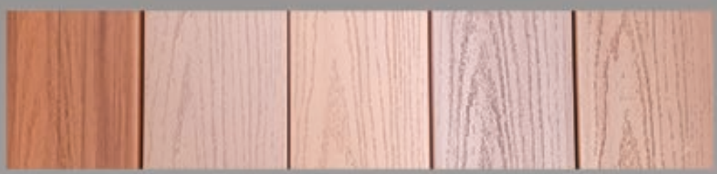
Chestnut Driftwood Sandalwood Weathered Wood Sandstone