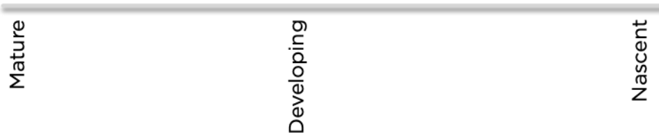
Fig. 2. Y-axis of the Knowledge-Method matching Matrix

41 The Y-axis is also a continuum that ranges roughly from Nascent condition-of-knowledge to Developing to Mature (see 42 Figure 2). When the condition of knowledge (about a specific phenomena, in a topical area, for a discipline, or for society and 43 science as a whole) is low (Nascent), the types of methods that are best used fall on the left side of the X-axis continuum. As 44 the condition of knowledge develops, the best methods move toward the right side of the X-axis.