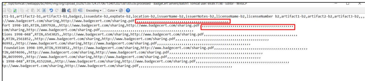
Exhibit 4: Sample error message

If extra columns beyond 21 have been added, you will get an error message (Exhibit 4) with commas representing the empty columns and your file will fail to upload. If this occurs, go back to the file and remove/delete the extra columns past “artifact3-b1” and upload your file again.