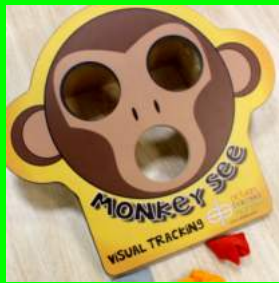
842 - MONKEY SEE TOSS