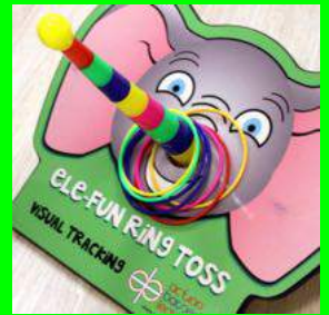
847 - ELE-FUN RING TOSS