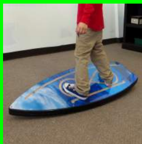
801 - ABC PATHWAYS SURFBOARD