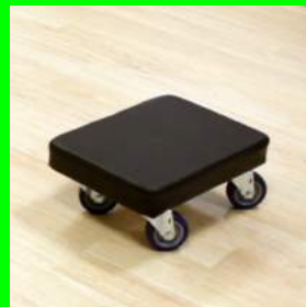
844 - PADDED SCOOTER