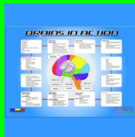
820 - BRAINWORKS POSTER