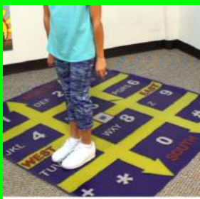
885 - MATH MAT