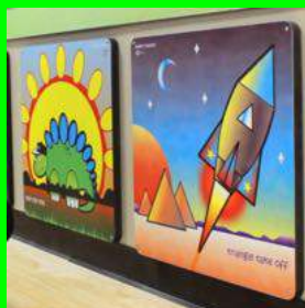
880 - SHAPE TRACERS