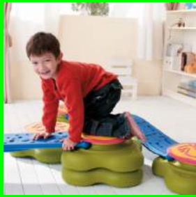
524 - WATER LILY & BRIDGES