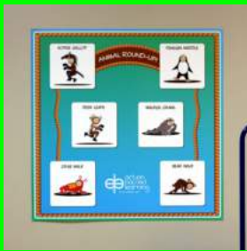
883 - ANIMAL ROUND-UP