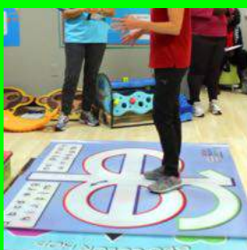
886 - ABL PATHWAYS MAT