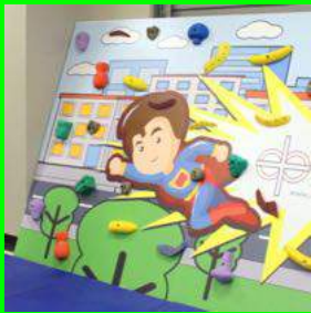
826 - VEGGIE HERO CLIMBING WALL