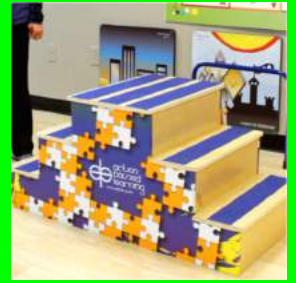
836 - ASSESSMENT STEPS