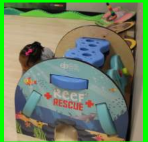
848 - REEF RESCUE