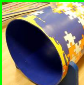
843 - CRAWL TUNNEL