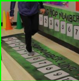
884 - FROG HOP NUMBER LINE