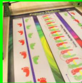
889 - PATTERN WALKING MAT