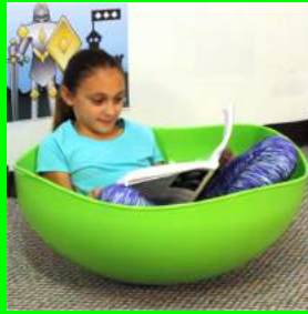
507 - ROCKIN TURTLE SHELL