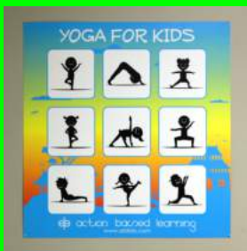
882 - KIDS YOGA POSTER