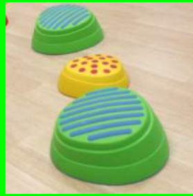
824 - COLORED ROCK OBSTACLES