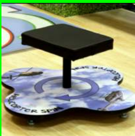
841 - HELICOPTER SPIN