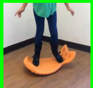
821 - WHALER SENSOY BOARD