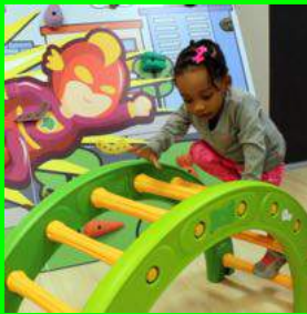
800 - ARCHED LADDER