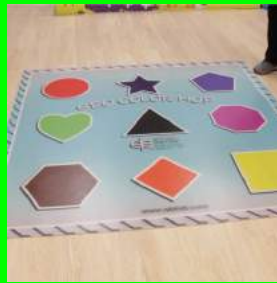
881 - GEO COLOR HOP