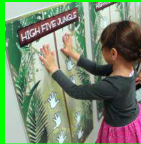
890 - HIGH FIVE JUNGLE