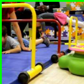
840 - OVER-UNDER BARS