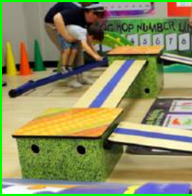
807 - VEGGIE BOXES