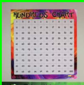
817 - HUNDREDS CHART