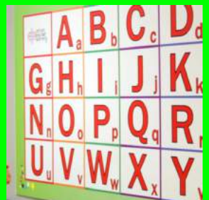
814 - LETTER LEARNING POSTER