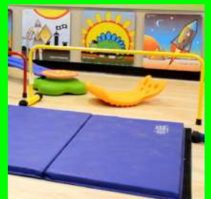
818 - ROLL AND CRAWL MAT