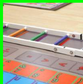
827 - ABL LEARNING LADDER