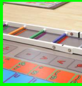
827 - ABL LEARNING LADDER