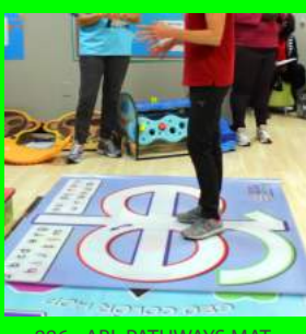
886 - ABL PATHWAYS MAT