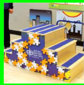
836 - ASSESSMENT STEPS