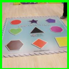
881 - GEO COLOR HOP