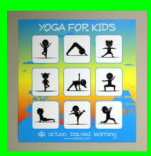
882 - KIDS YOGA POSTER