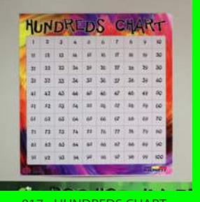
817 - HUNDREDS CHART