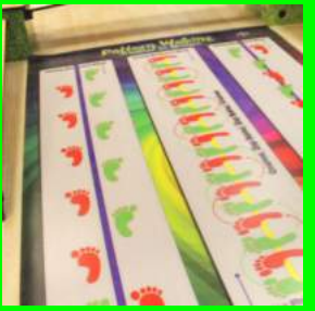
880 - PATTERNI WAI KING MAT