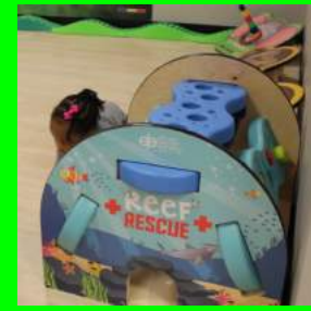
848 - REEF RESCUE