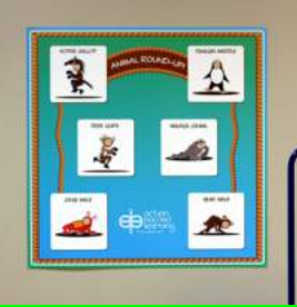
883 - ANIMAL ROUND-UP