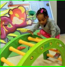
800 - ARCHED LADDER