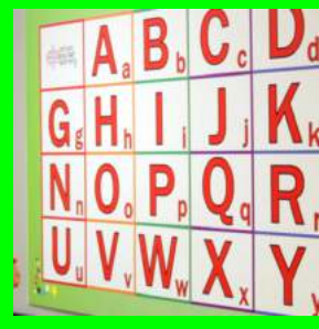
814 - LETTER LEARNING POSTER