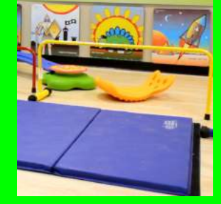
844 - SCOOTER BOARD