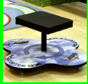
841 - HELICOPTER SPIN 840 - OVER-UNDER BARS