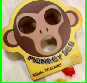
842 - MONKEY SEETOSS