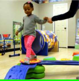
524 - WATER LILY & BRIDGES