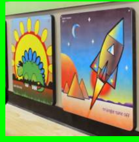
880 - SHAPE TRACERS