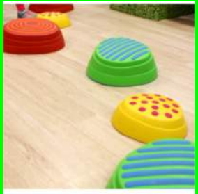
24 - COLORED BOCK OBSTACLES