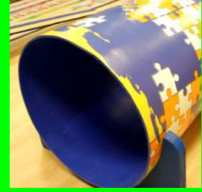
843 - CRAWL TUNNEL