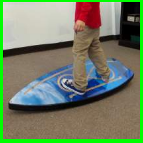
801 - ABC PATHWAYS SURFBOARD