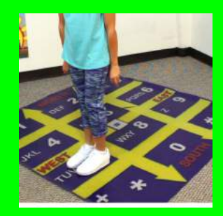
885 - MATH MAT