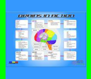
820 - BRAINWORKS POSTER