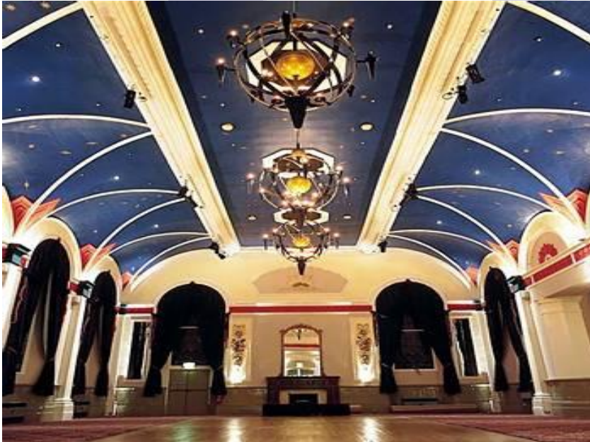
The Palace Hotel Ballroom