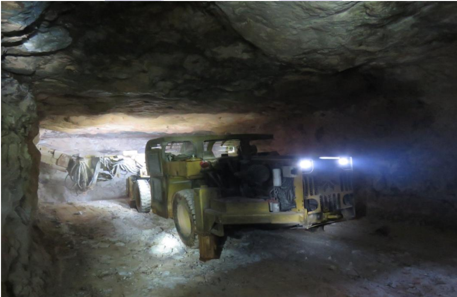
Scaling the face underground

The visit was led by the mine manager Jim Daykin. Following a presentation on the history of Fauld mine and of course after the very important safety induction we were driven into the mine for approx 5kms to access the working faces. The visit gave an excellent insight into all the aspects of gypsum mining and was thoroughly enjoyed by all.