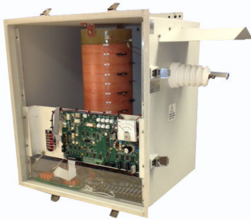
PC-1000C4 Antenna Coupler

5055 Belmont, Beaumont, TX 77707 Phone +409.842.1717 Fax +409.842.2987 sales@southernavionics.com