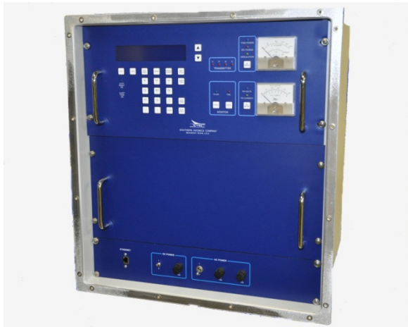
IP66 Weather Enclosure

5055 Belmont, Beaumont, TX 77707 Phone +409.842.1717 Fax +409.842.2987 sales@southernavionics.com