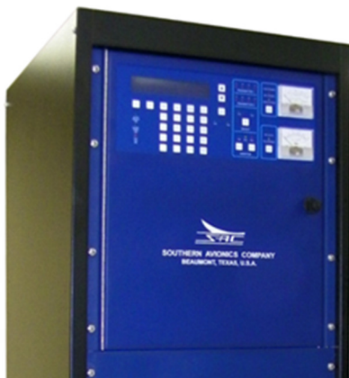
New Front Door Design

The 5 Port Switch can be used to connect to a WiFi Network, Land Line Network, or any of our Ethernet Control and Monitoring Options or Remote Control Unit Connection Options.