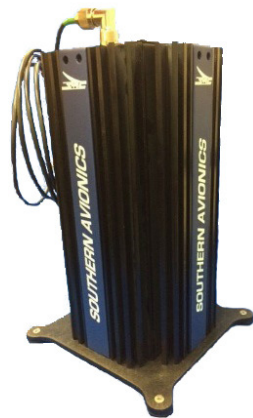
50 Ohm, 250 Watt Test Load