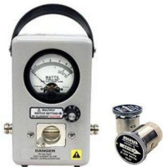
Bird Watt Meter and Element