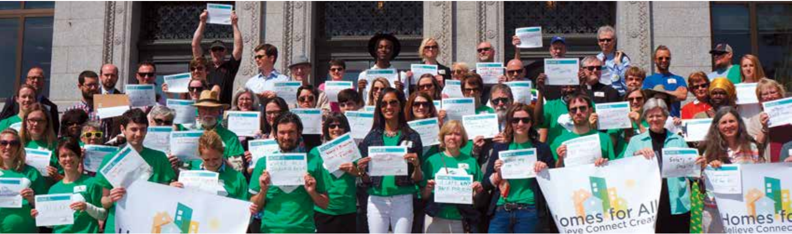
Habitat Housing Heroes gathered at the state capitol in May in support of the Homes for All coalition.