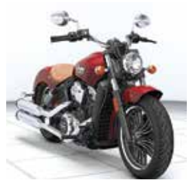
▲ 2017 Indian Scout