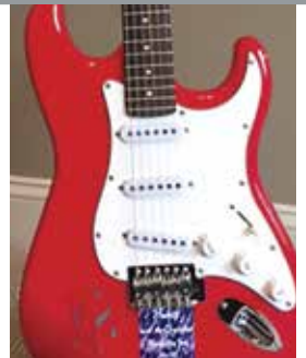
▲ Autographed Prince Guitar from 1984–1985 Purple Rain tour