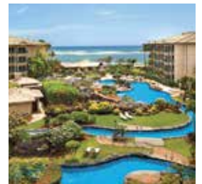
▲ Week Stay in Kauai