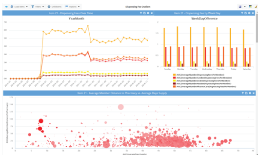
View outlier groups

Overcome and outsmart fraud, waste and abuse with Absolute Insight's advanced features and straightforward interface that puts program integrity in control of payment integrity.