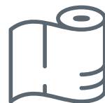
Disinfectant/ Paper Towels